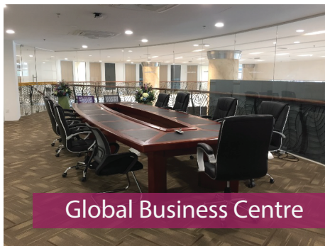
Global Business Centre